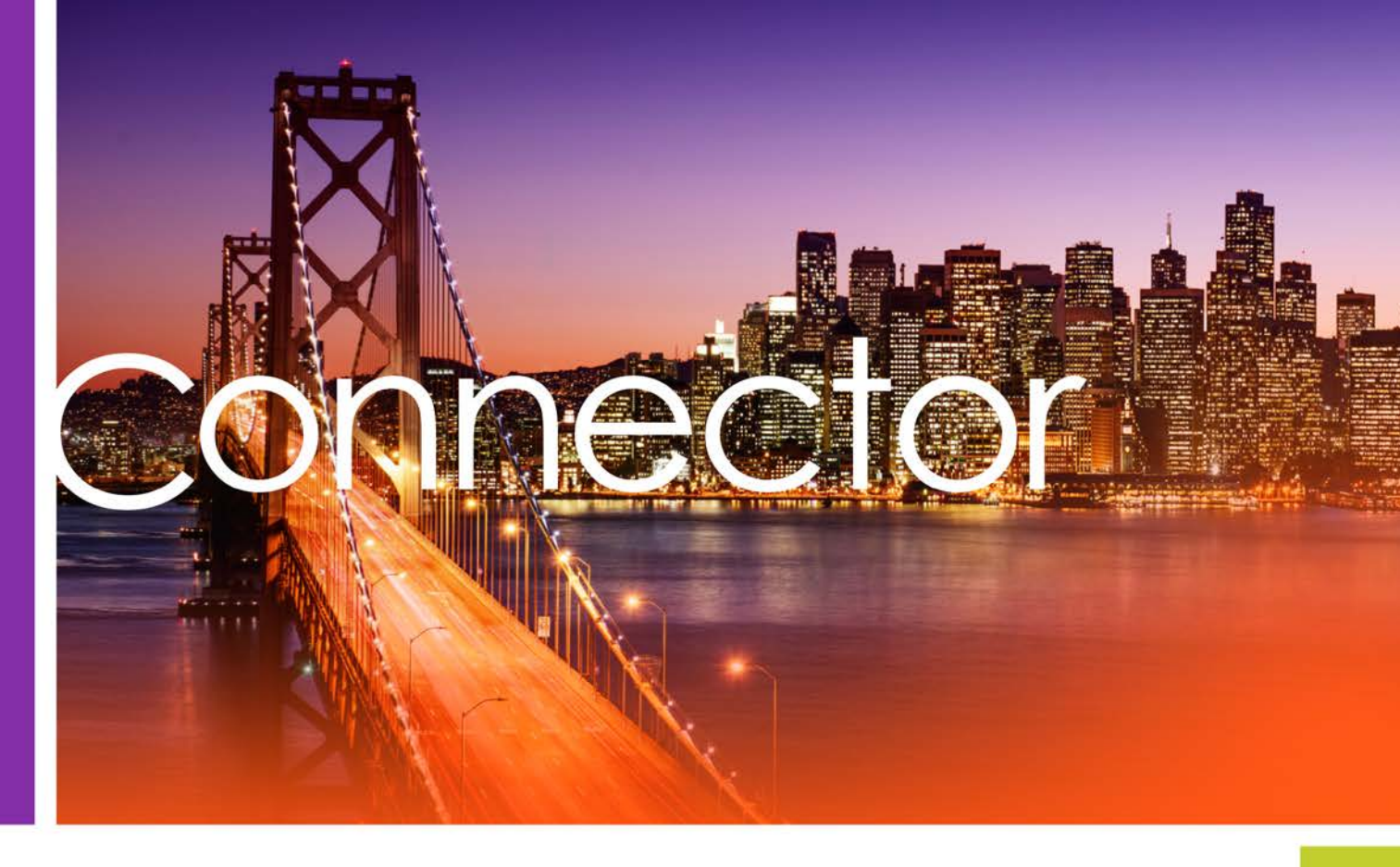
The information provided is current as of September 13, 2016